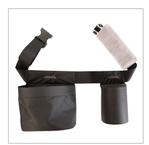
Mirka Multi-purpose belt