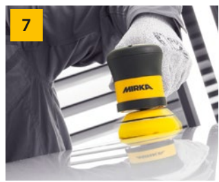
Polish by gently pressing. Use at moderate speed. Wipe clean and check the surface. Repeat if necessary.