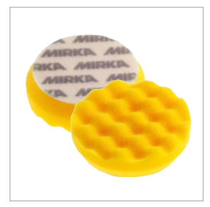
Mirka foam pad, yellow waffle