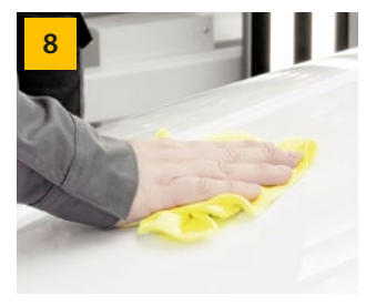
Use Mirka soft micro fibre cloth for final cleaning.