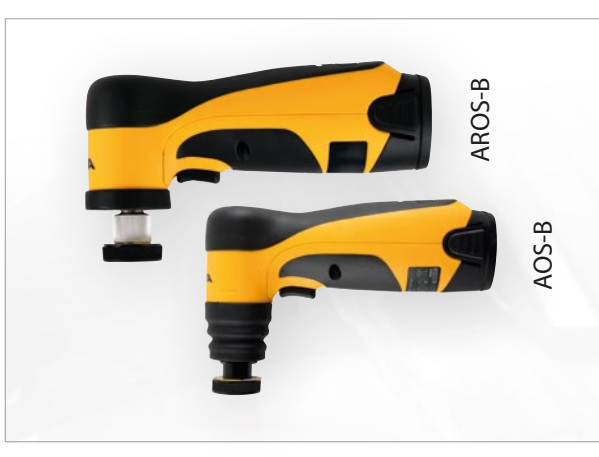
Mirka® AOS-B and AROS-B Sanders