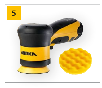
For polishing and finalising use the cordless Mirka® AROP-B 312NV polisher, Mirka® Yellow waffle pad and Polarshine® 12.