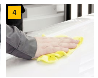
Wipe clean and check the surface. Repeat step 3 if needed. Use Mirka soft micro fibre cloth.