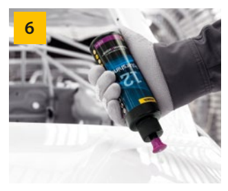
Apply a small amount of Polarshine<sup>®</sup> 12 on the polishing pad or directly to the defected surface area.