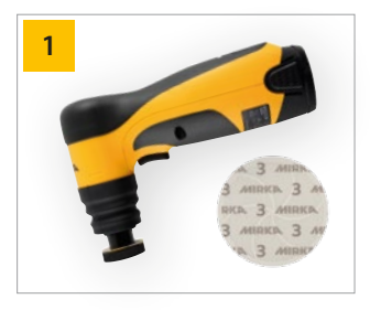
For removing of defect use Novastar® SR and Mirka® AOS-B 130NV sander.

Spot repair with Mirka® AOS-B sander and the Mirka® AROP-B cordless polisher