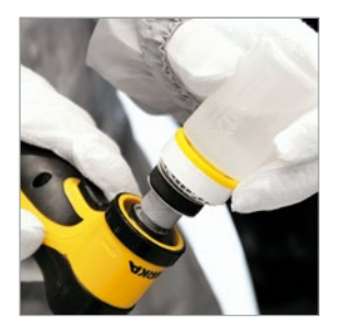
Damper with detergent or water